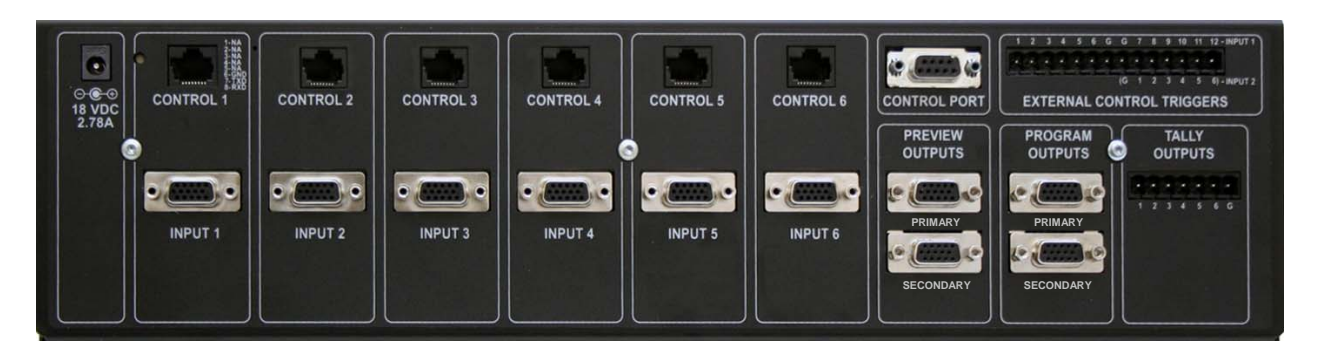
Figure 3: Back panel section of ProductionVIEW HD

Vaddio Part Numbers 999-5600-000 - ProductionVIEW HD (NTSC) 999-5600-001 - ProductionVIEW HD (PAL)